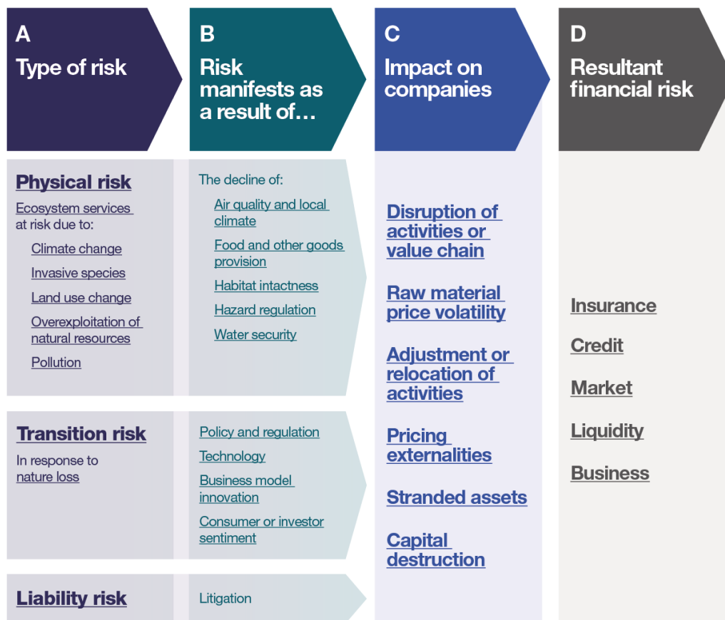
Figure 1: Framework for identifying nature-related financial risks xii

The framework, presented in Figure 1, can be a useful tool for insurers to identify and assess nature-related risks, integrating them into financial decision making. It was co-created by banks, asset managers, CISL’s Centre for Sustainable Finance and academics from the University of Cambridge conservation cluster. The framework was built on the Dasgupta Review of the economics of biodiversity xvi , enabling